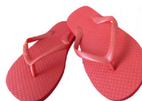
Thongs or Sandals